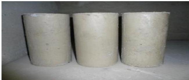
Figure 1 Fly ash based Geo-Polymer Concrete

strength concrete offers a lot of advantages over normal strength concrete, such as gaining higher strength at early days and higher mechanical strengths at later age.