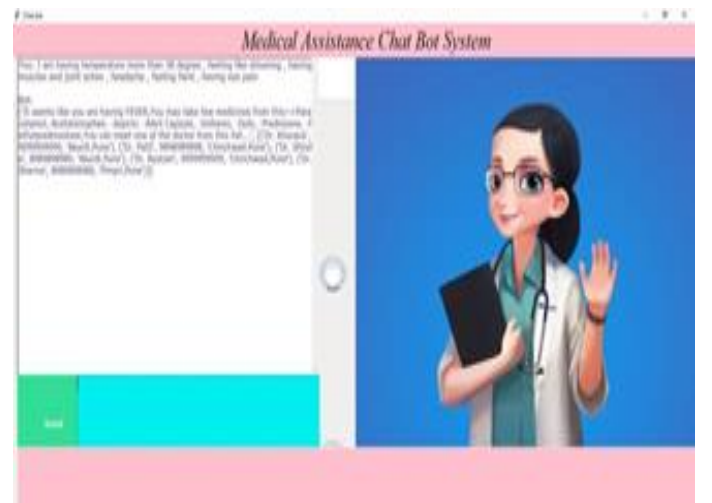
Fig 5. Result 3