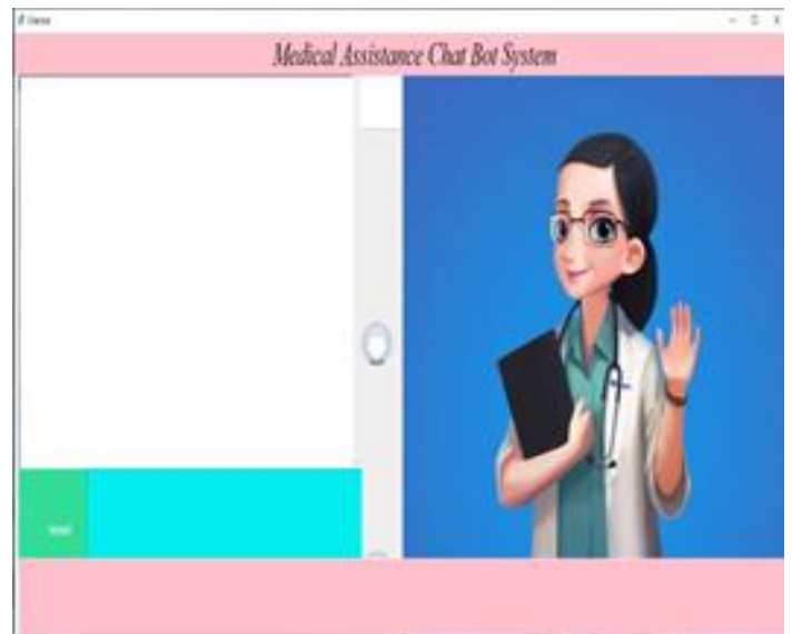
Fig 3. Result 1