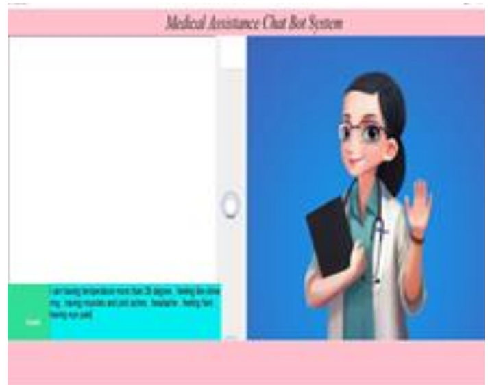
Fig 4. Result 2