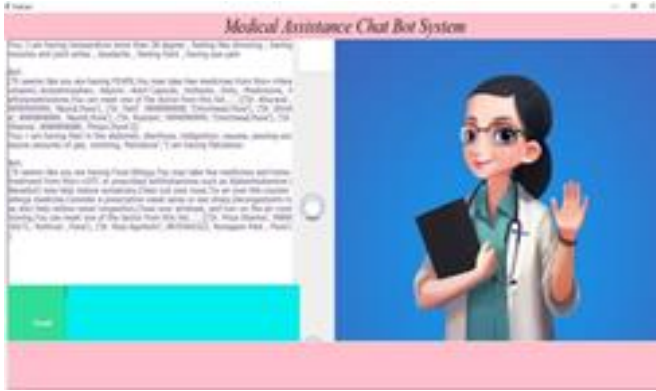
Fig 5. Result 4