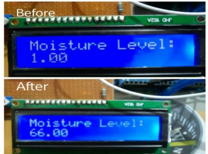
Figure 3 Shows the Values of moisture displayed on LCD