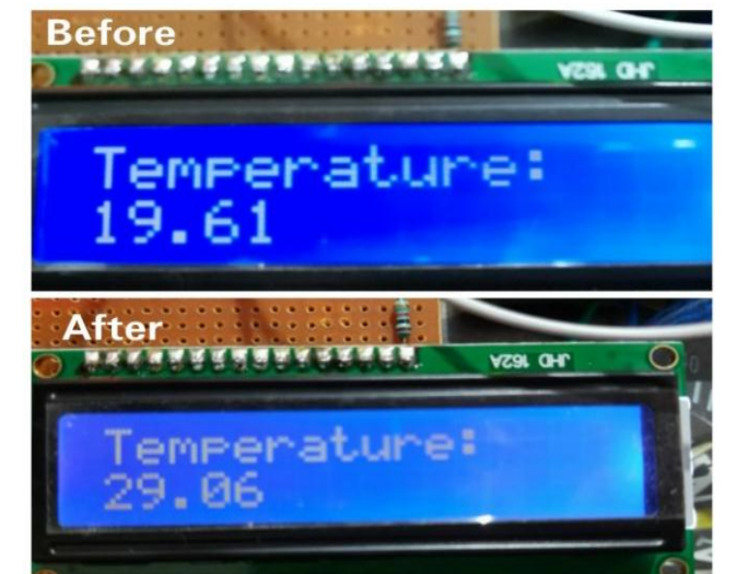
Figure 5. Shows the Values of Temperature displayed on LCD