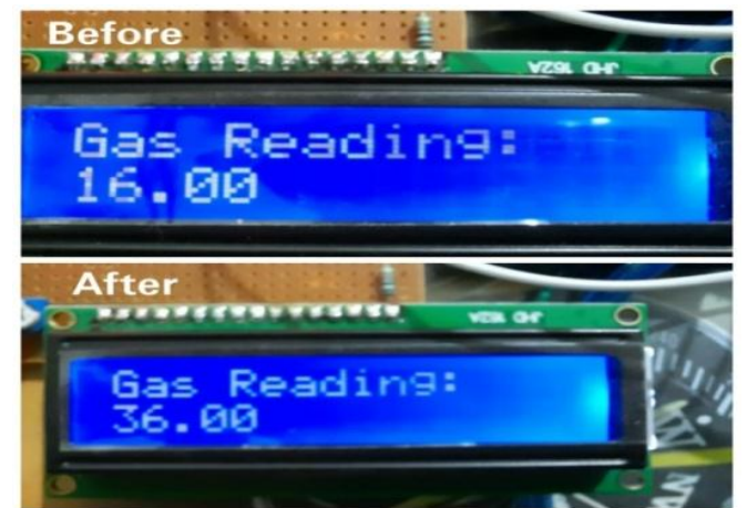
Figure 4. Shows the Values of Gas displayed on LCD